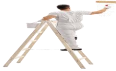
p _ inter