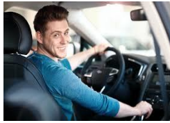
dri _ er