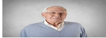
grandfa _ _ er